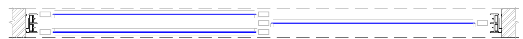
PLAN OF ACCUCEL SLIDING WINDOW - 3 TRACK